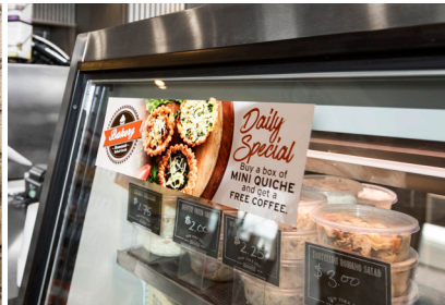
ULTRA LOW-TACK FILMS