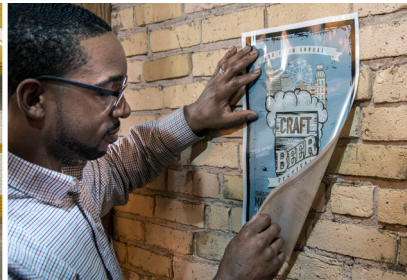
ELECTRICALLY CHARGED FILMS