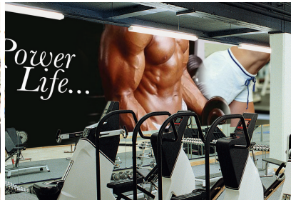
WALL GRAPHIC VINYLs